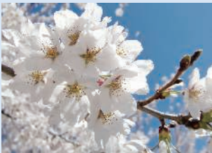
Cherry blossoms in our head office

We are seeking to be a “Green Company”. These days, there are many crises out there caused by environmental degradation, so we have to take good care of environment not only in our country, but also in the world. Although it costs money to protect the environment, in order to stop global warning, take measures against global water shortage, combat deforestation and desertification, and face other problems threatening humankind, we consider it crucial to go to the expense of environmental measures. That is why we have acquired ISO 14001 certification in 2000 in order to promote environmental protection.