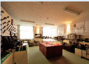
Toyo Measurement Equipment History Museum