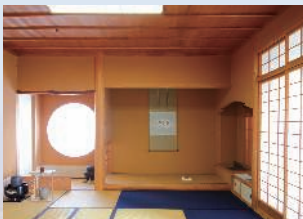
Japanese Tea room “SHOSEIAN”